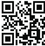
VIEW MUSTANG PARKS FACILITY OF THE YEAR AWARD VIDEO BY SCANNING THE QR CODE